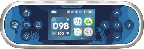
PB563 control panel design

3.5 inch TFT color display screen, 10 capacitive touch buttons